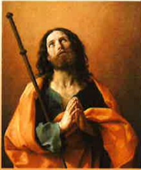
St. James Church 299 Red Oak Dr. Aitkin www.aitkincatholic.org