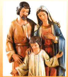
Holy Family Church 2 S Maddy St. McGregor www.mcgregorcatholicchurch.org

Office Hours: M-Th 9am-5pm, Fri. 9am-Noon Phone: 218-927-6581 Fax: 218-927-6589 Email: office@aitkincatholic.org Mailing Address: 299 Red Oak Dr., Aitkin, MN 56431 Connect to Holy Family and St. James Church via Facebook