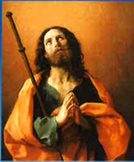
St. James Church 299 Red Oak Dr. Aitkin www.aitkincatholic.org