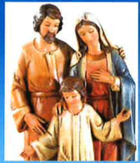
Holy Family Church 2 S Maddy St. McGregor www.mcgregorcatholicchurch.org

Office Hours: M-Th 9am-5pm, Fri. 9am-Noon Phone: 218-927-6581 Fax: 218-927-6589 Email: office@aitkincatholic.org Mailing Address: 299 Red Oak Dr., Aitkin, MN 56431 Connect to Holy Family and St. James Church via Facebook