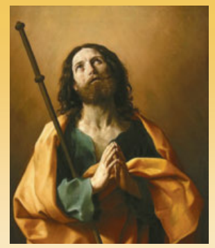
St. James Church 299 Red Oak Dr. Aitkin www.aitkincatholic.org