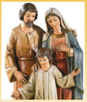
Holy Family Church 2 S Maddy St. McGregor www.mcgregorcatholicchurch.org

Office Hours: M-Th 9am-5pm, Fri. 9am-Noon Phone: 218-927-6581 Fax: 218-927-6589 Email: office@aitkincatholic.org Mailing Address: 299 Red Oak Dr., Aitkin, MN 56431 Connect to Holy Family and St. James Church via Facebook