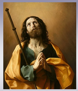
St. James Church 299 Red Oak Dr. Aitkin www.aitkincatholic.org