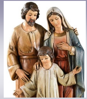
Holy Family Church 2 S Maddy St. McGregor www.mcgregorcatholicchurch.org

Office Hours: M-Th 9am-5pm, Fri. 9am-Noon Phone: 218-927-6581 Fax: 218-927-6589 Email: office@aitkincatholic.org Mailing Address: 299 Red Oak Dr., Aitkin, MN 56431 Connect to Holy Family and St. James Church via Facebook