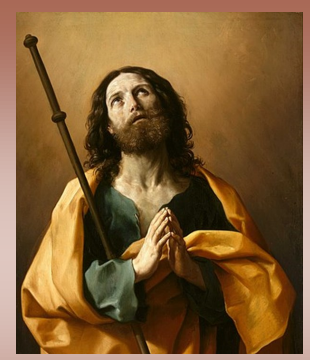
St. James Church 299 Red Oak Dr. Aitkin www.aitkincatholic.org