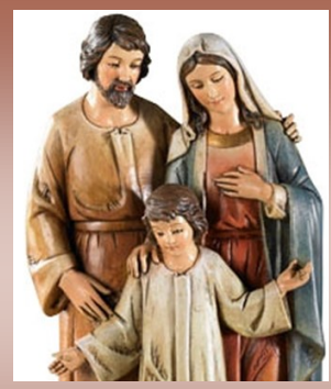
Holy Family Church 2 S Maddy St. McGregor www.mcgregorcatholicchurch.org

Office Hours: M-Th 9am-5pm, Fri. 9am-Noon Phone: 218-927-6581 Fax: 218-927-6589 Email: office@aitkincatholic.org Mailing Address: 299 Red Oak Dr., Aitkin, MN 56431 Connect to Holy Family and St. James Church via Facebook