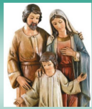
Holy Family Church 2 S Maddy St. McGregor www.mcgregorcatholicchurch.org

Office Hours: M-Th 9am-5pm, Fri. 9am-Noon Phone: 218-927-6581 Fax: 218-927-6589 Email: office@aitkincatholic.org Mailing Address: 299 Red Oak Dr., Aitkin, MN 56431 Connect to Holy Family and St. James Church via Facebook