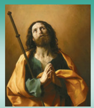
St. James Church 299 Red Oak Dr. Aitkin www.aitkincatholic.org