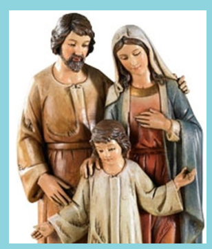
Holy Family Church 2 S Maddy St. McGregor www.mcgregorcatholicchurch.org

Office Hours: M-Th 9am-5pm, Fri. 9am-Noon Phone: 218-927-6581 Fax: 218-927-6589 Email: office@aitkincatholic.org Mailing Address: 299 Red Oak Dr., Aitkin, MN 56431 Connect to Holy Family and St. James Church via Facebook