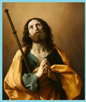
St. James Church 299 Red Oak Dr. Aitkin www.aitkincatholic.org