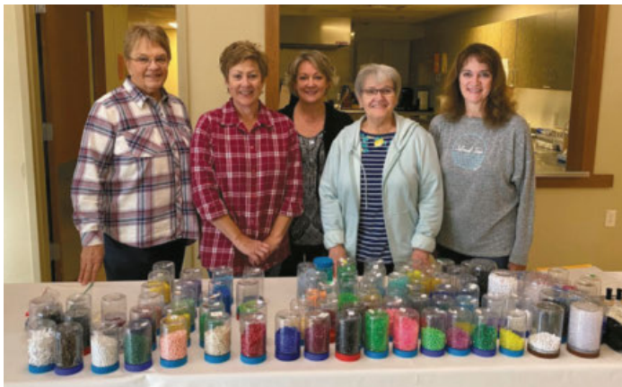
The St. James Rosary Makers were recently blessed with a donation of many rosary beads.

(HF)-Holy Family • (SJ)-Saint James • (OL) Our Lady of Fatima