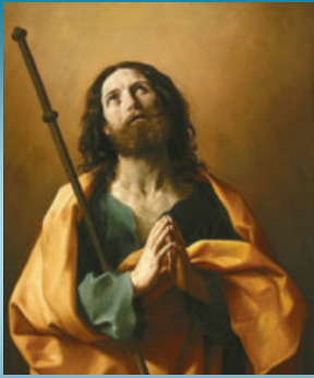
St. James Church 299 Red Oak Dr. Aitkin www.aitkincatholic.org