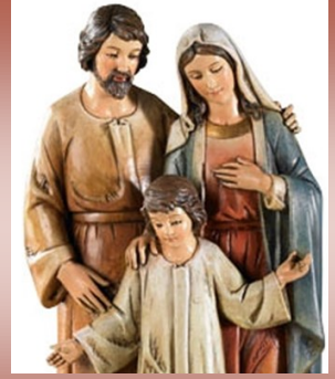
Holy Family Church 2 S Maddy St. McGregor