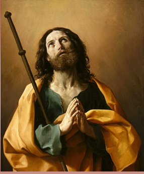
St. James Church 299 Red Oak Dr. Aitkin