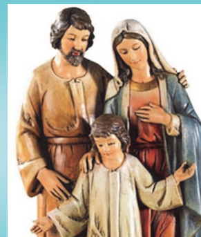
Holy Family Church 2 S Maddy St. McGregor