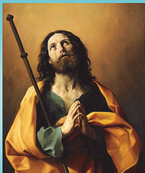
St. James Church 299 Red Oak Dr. Aitkin