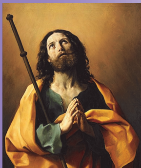
St. James Church 299 Red Oak Dr. Aitkin