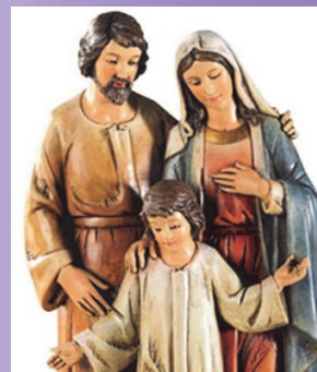
Holy Family Church 2 S Maddy St. McGregor

Mailing Address: 299 Red Oak Dr., Aitkin, MN 56431