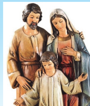
Holy Family Church 2 S Maddy St. McGregor

Mailing Address: 299 Red Oak Dr., Aitkin, MN 56431