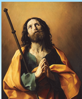
St. James Church 299 Red Oak Dr. Aitkin